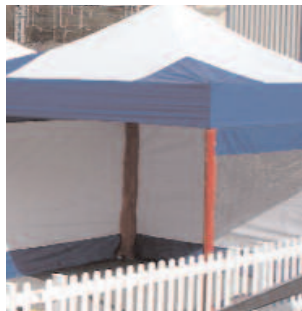
STANDARD GAZEBO Includes 4 side curtains and plastic floor