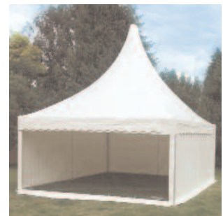
PAGODA STYLE GAZEBO Includes 4 side curtains and plastic floor